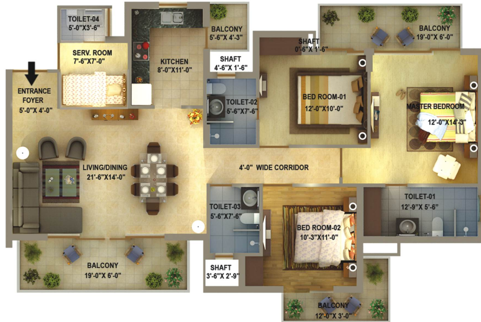
3 BHK TYPE - 1 + SERVANT ROOM (2D) UNIT SALE AREA = 1945.00 SQ.FT.