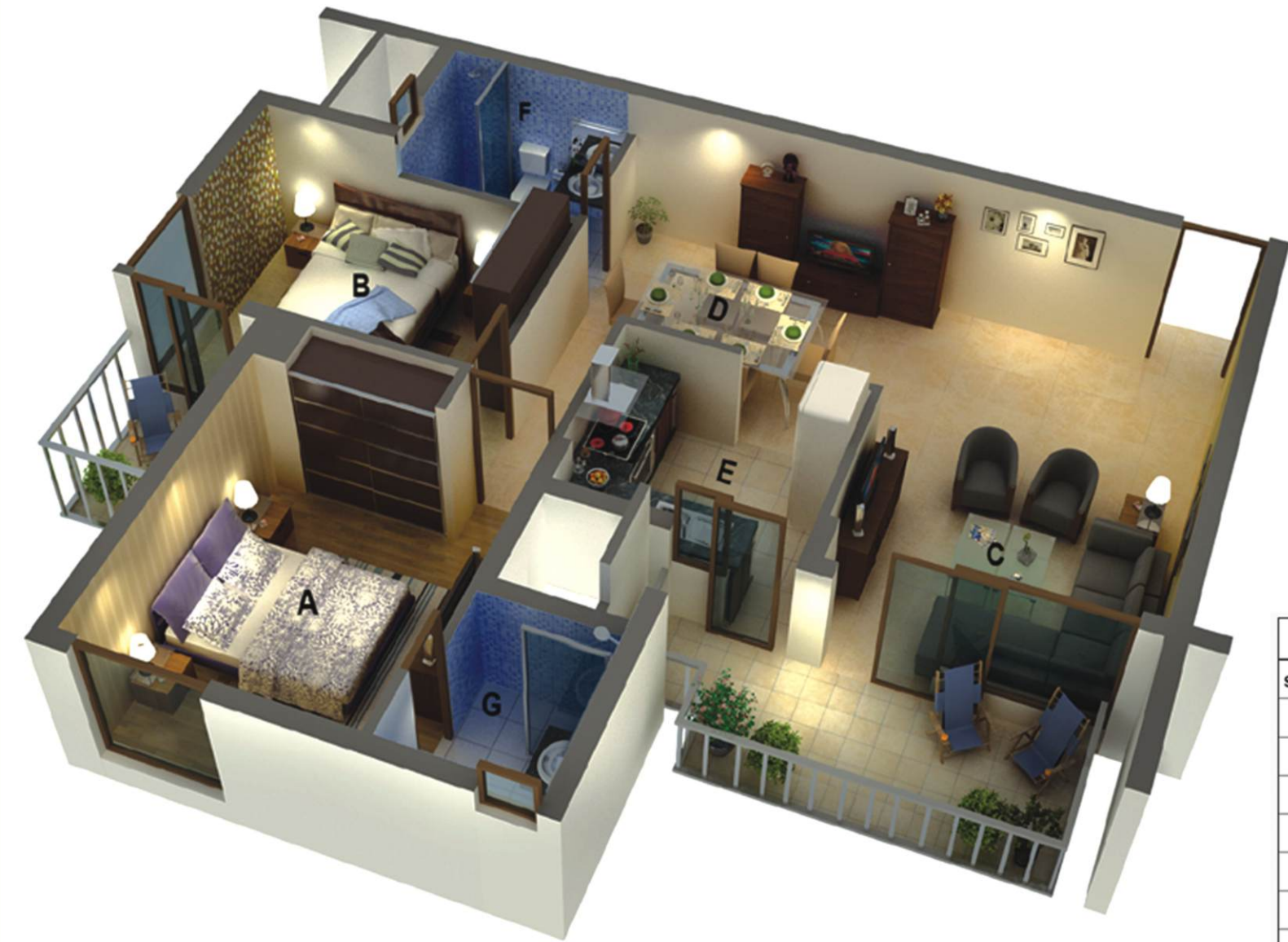
2 BHK TYPE - 3 (3D) UNIT SALE AREA = 1330.00 SQ.FT.

Note : All floor plans, layout plans, elevation and specifications are indicative and are subject to change as per Architect's decision without prior information. In order to provide reasonable architectural variations in the scheme, the architectural features may differ in different flats.