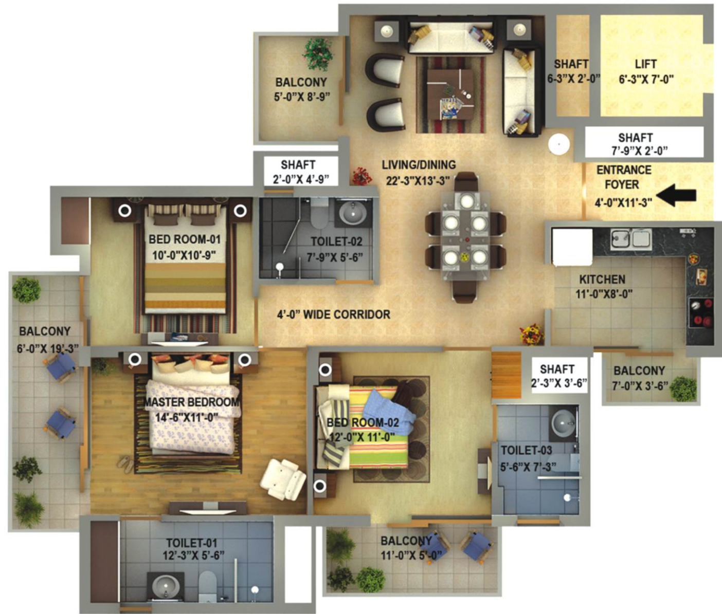
3 BHK TYPE - 1 (2D) UNIT SALE AREA = 1725.00 SQ.FT.