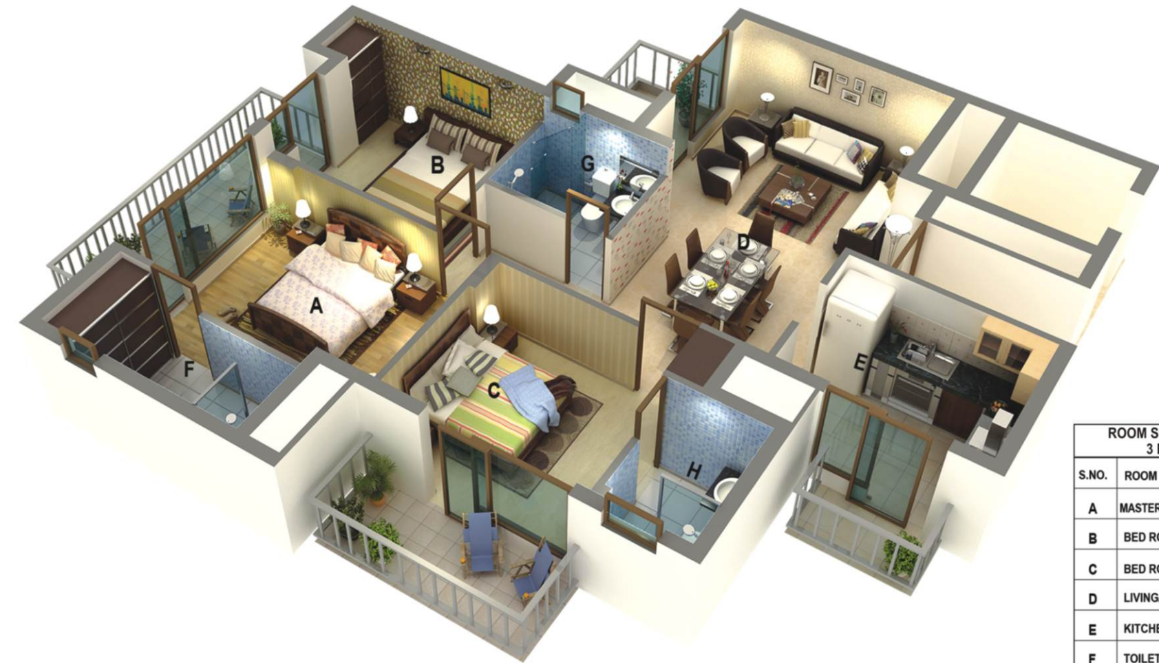
3 BHK TYPE - 1 (3D) UNIT SALE AREA = 1725.00 SQ.FT.

Note : All floor plans, layout plans, elevation and specifications are indicative and are subject to change as per Architect's decision without prior information. In order to provide reasonable architectural variations in the scheme, the architectural features may differ in different flats.