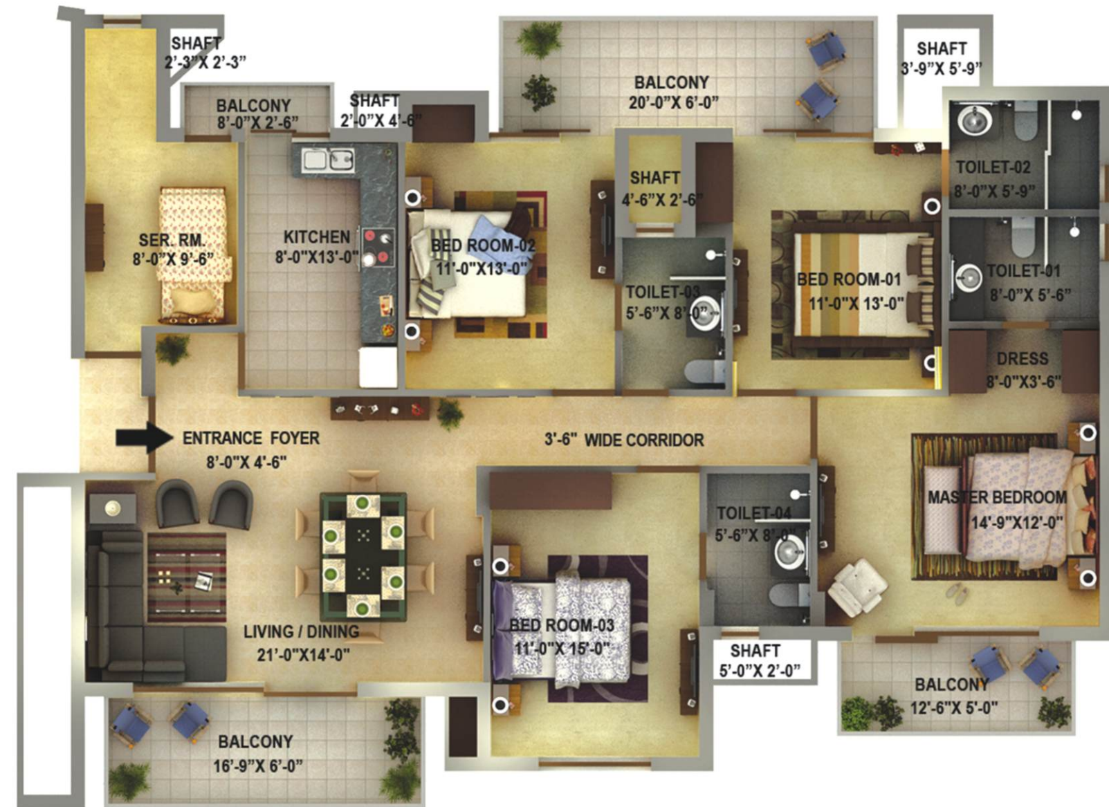
4 BHK + SERVANT ROOM (2D) UNIT SALE AREA = 2600.00 SQ.FT.