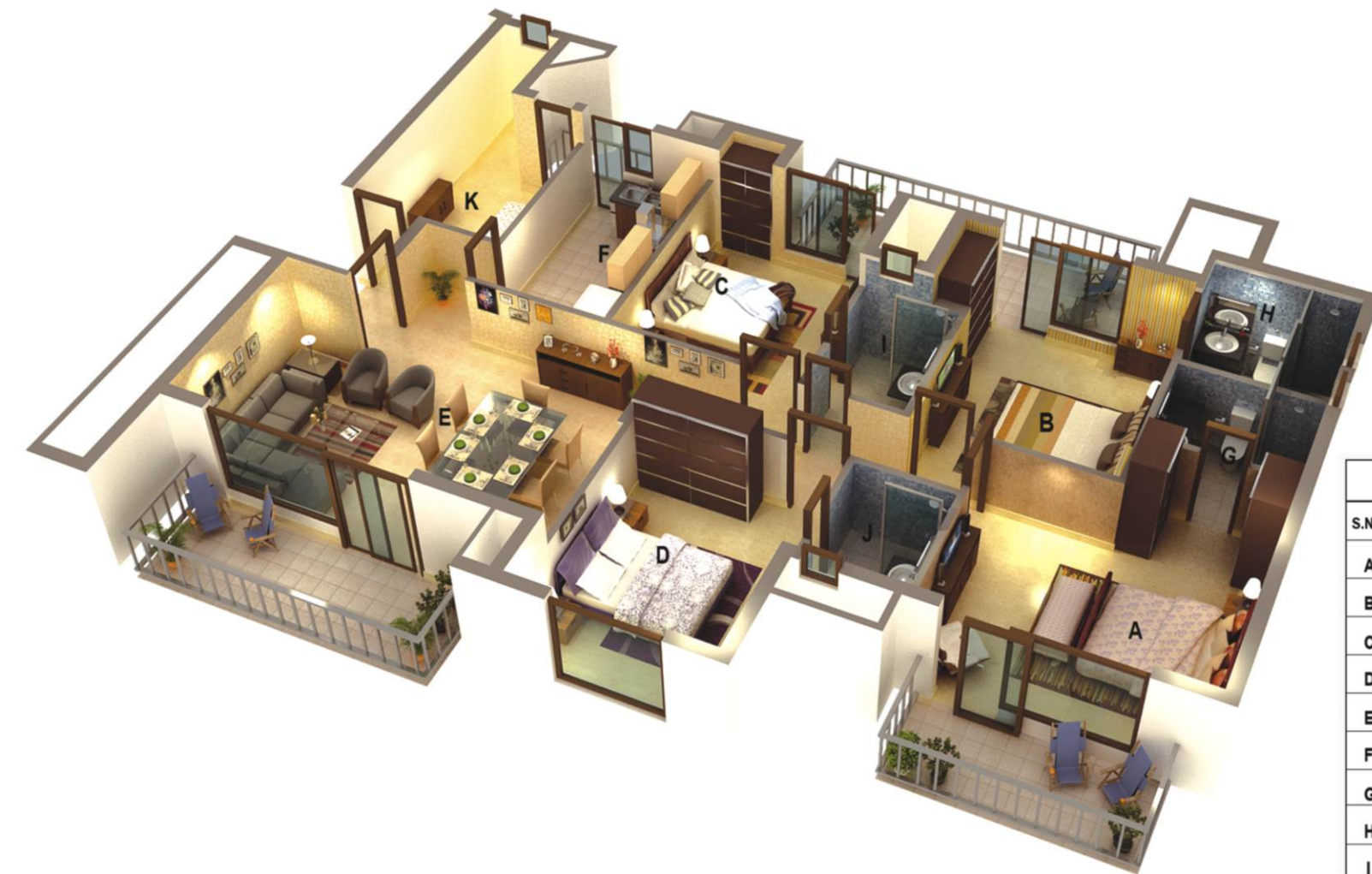
4 BHK + SERVANT ROOM (3D) UNIT SALE AREA = 2600.00 SQ.FT.

Note : All floor plans, layout plans, elevation and specifications are indicative and are subject to change as per Architect's decision without prior information. In order to provide reasonable architectural variations in the scheme, the architectural features may differ in different flats.