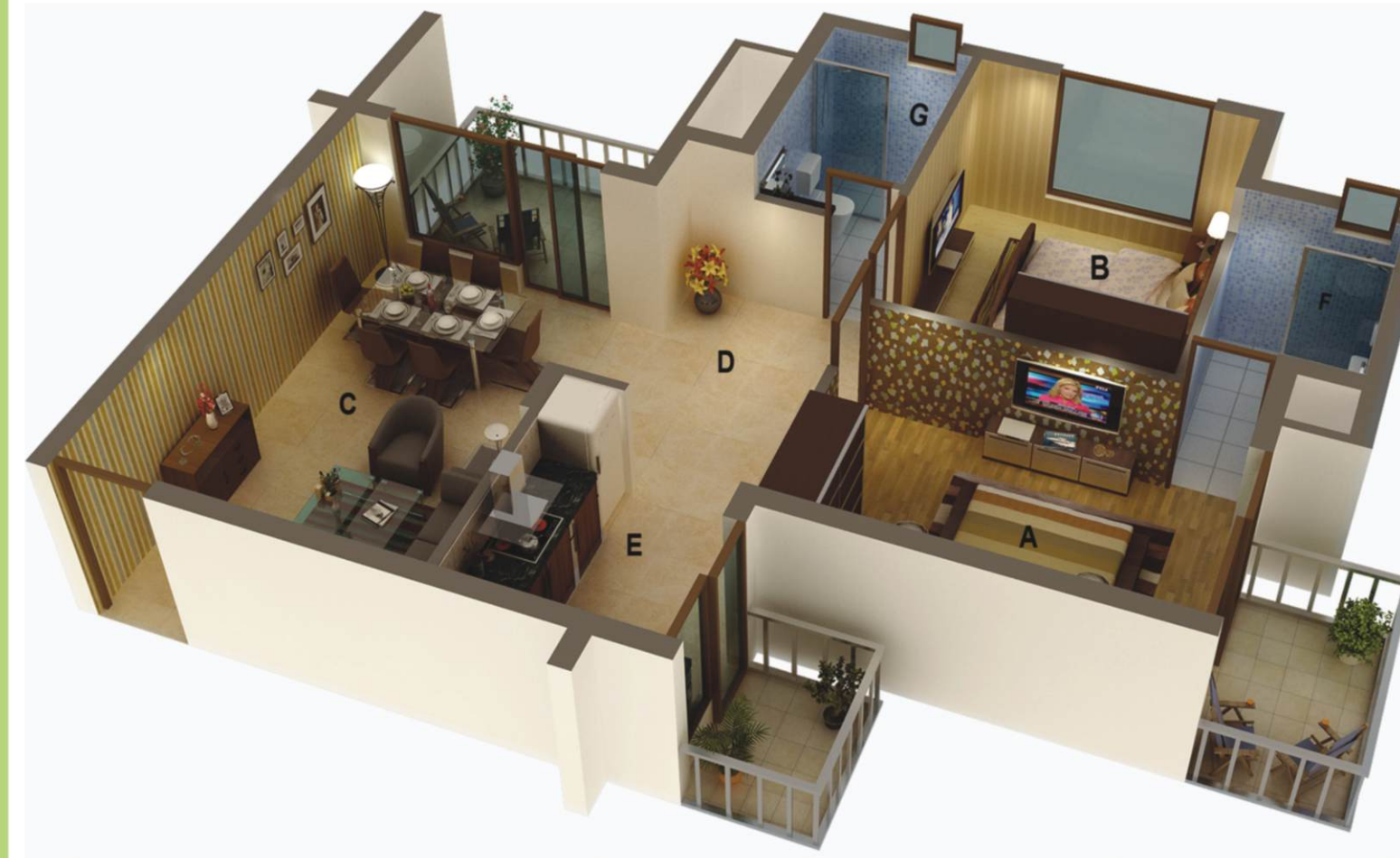
2 BHK TYPE - 1 (3D) UNIT SALE AREA = 1255.00 SQ.FT.

Note : All floor plans, layout plans, elevation and specifications are indicative and are subject to change as per Architect's decision without prior information. In order to provide reasonable architectural variations in the scheme, the architectural features may differ in different flats.