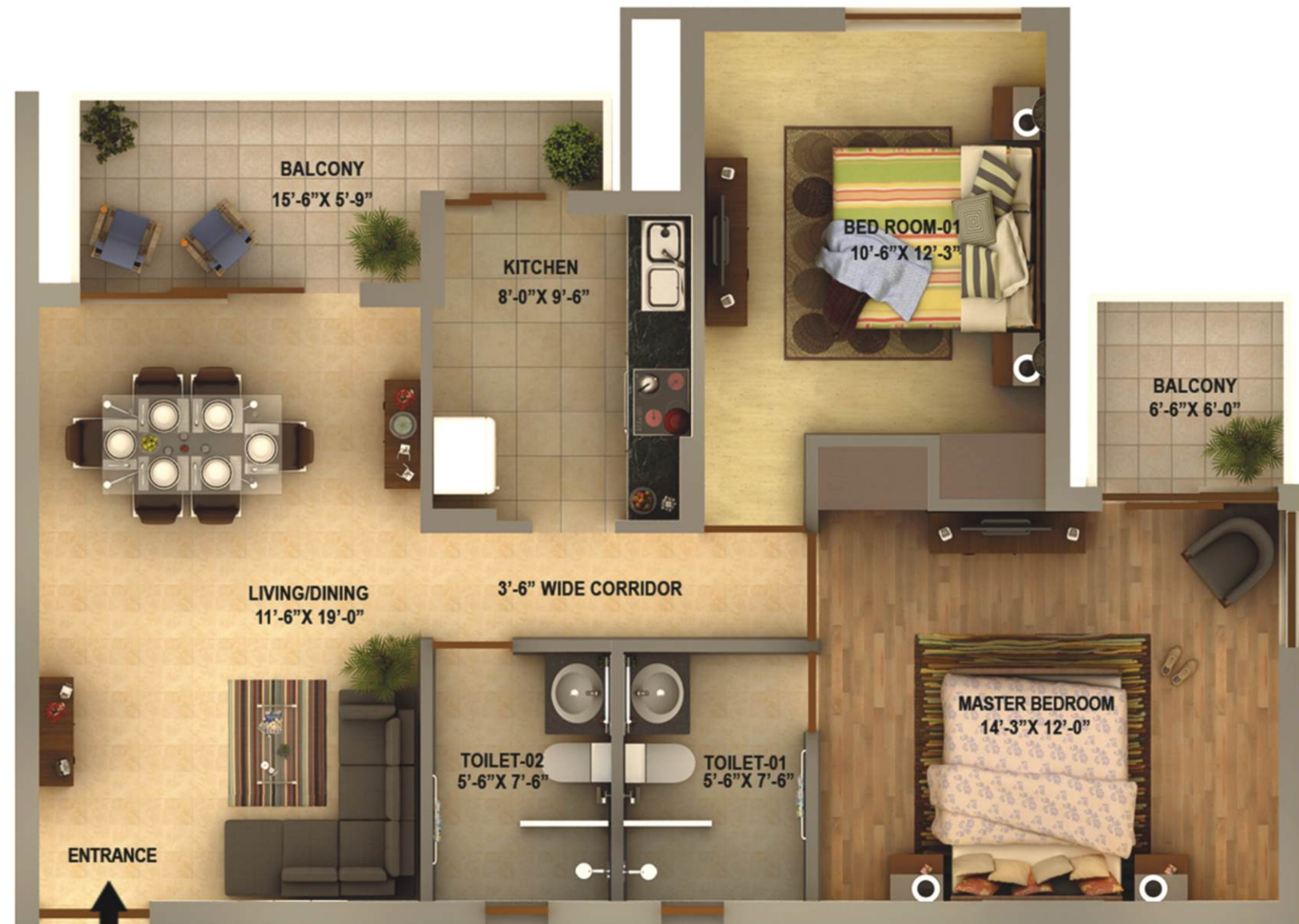
2 BHK TYPE - 2 (2D) UNIT SALE AREA = 1245.00 SQ.FT.