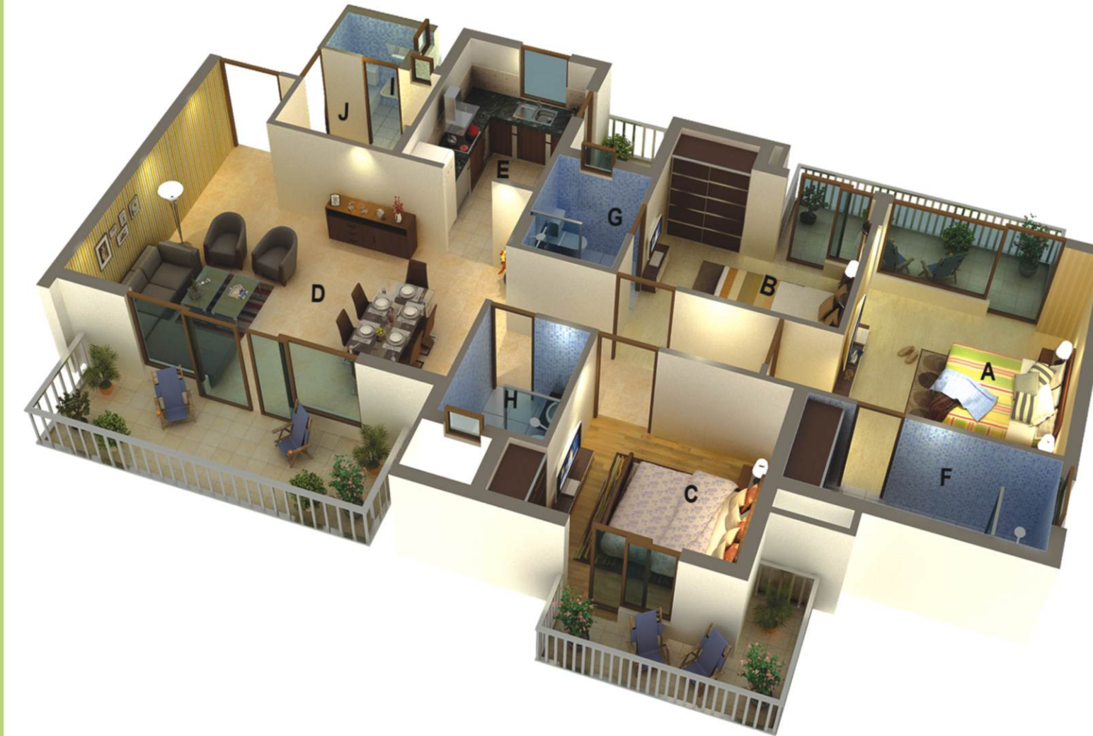
3 BHK TYPE - 1 + SERVANT ROOM (3D) UNIT SALE AREA = 1945.00 SQ.FT.

Note : All floor plans, layout plans, elevation and specifications are indicative and are subject to change as per Architect's decision without prior information. In order to provide reasonable architectural variations in the scheme, the architectural features may differ in different flats.