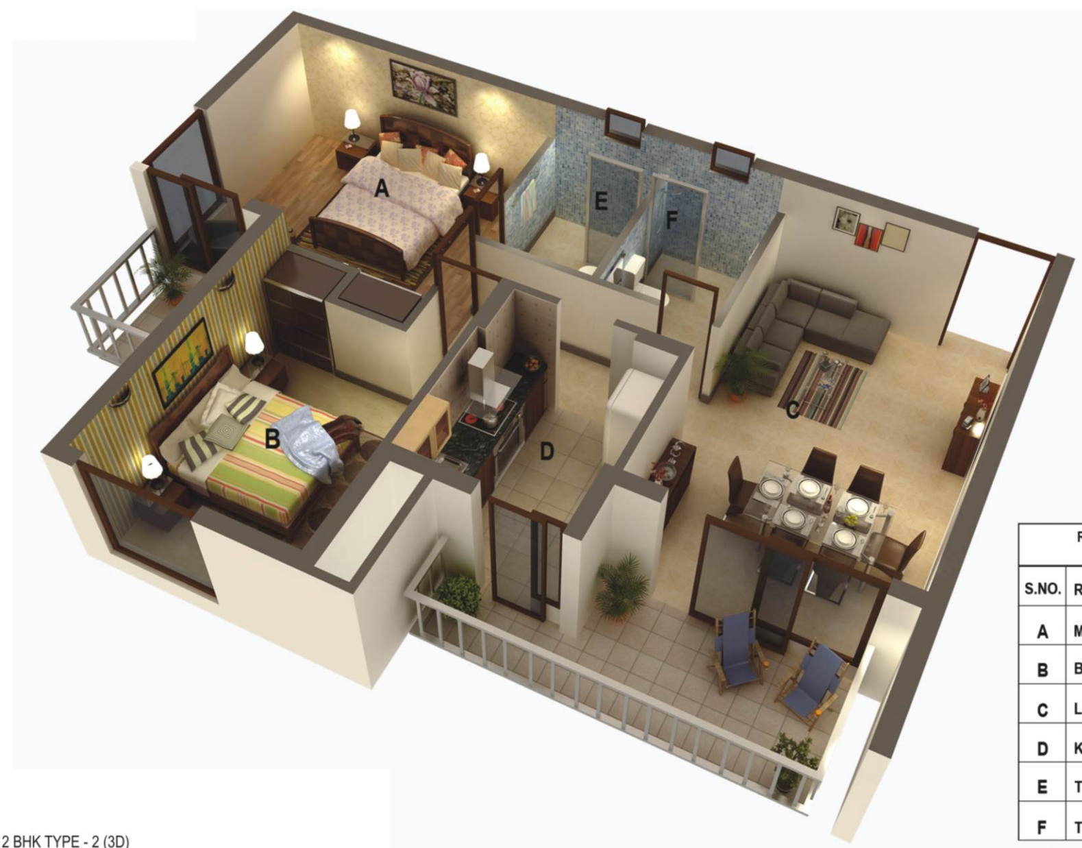
2 BHK TYPE - 2 (3D) UNIT SALE AREA = 1245.00 SQ.FT.

Note : All floor plans, layout plans, elevation and specifications are indicative and are subject to change as per Architect's decision without prior information. In order to provide reasonable architectural variations in the scheme, the architectural features may differ in different flats.