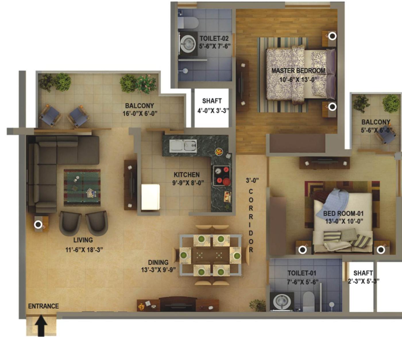
2 BHK TYPE - 3 (2D) UNIT SALE AREA = 1330.00 SQ.FT.