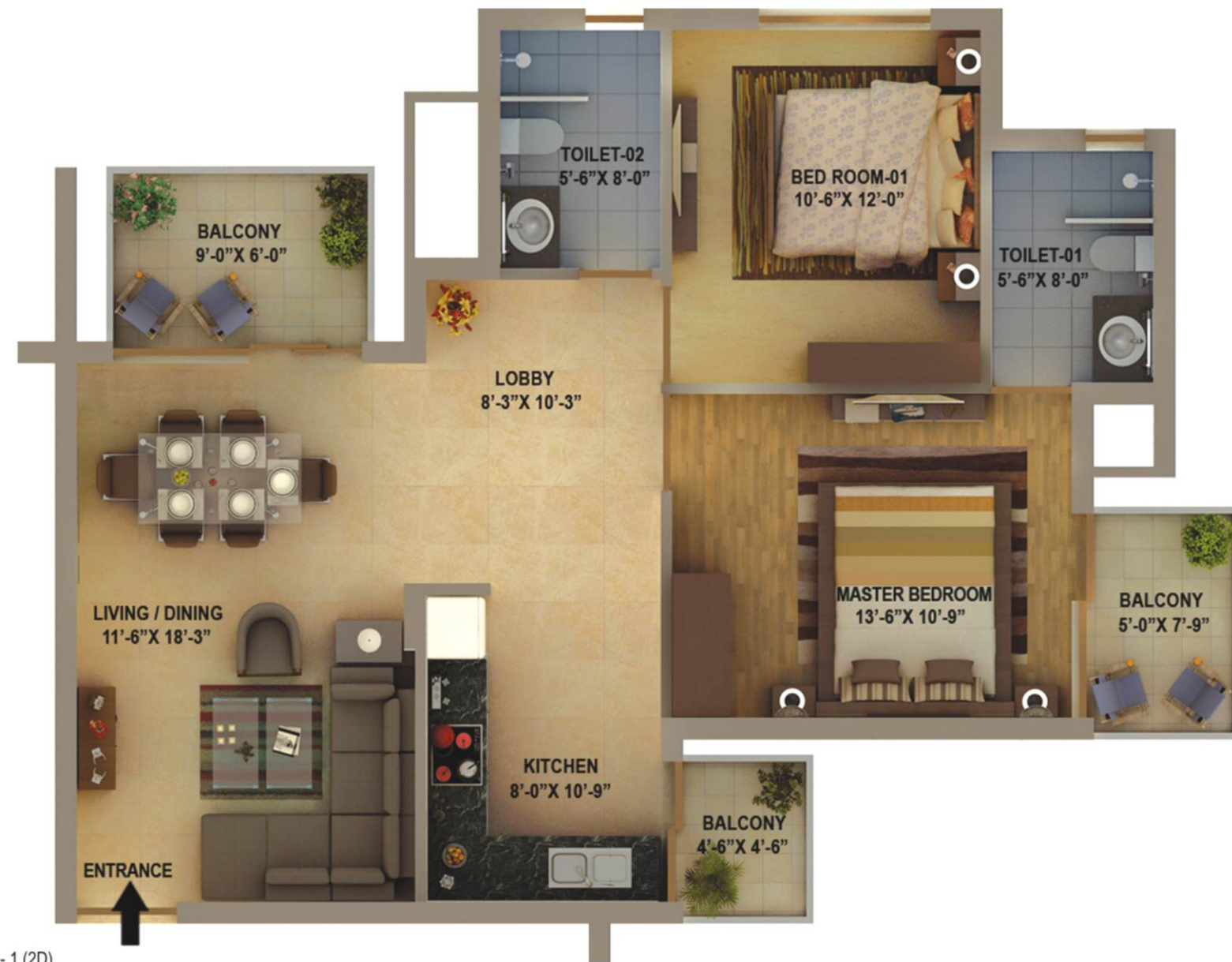
2 BHK TYPE - 1 (2D) UNIT SALE AREA = 1255.00 SQ.FT.