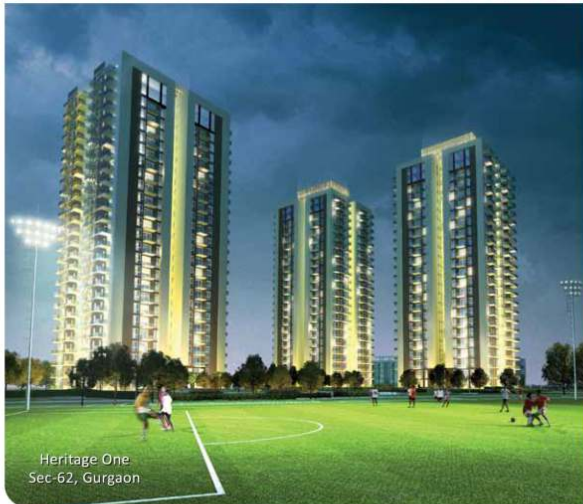
Heritage One Sec-62, Gurgaon