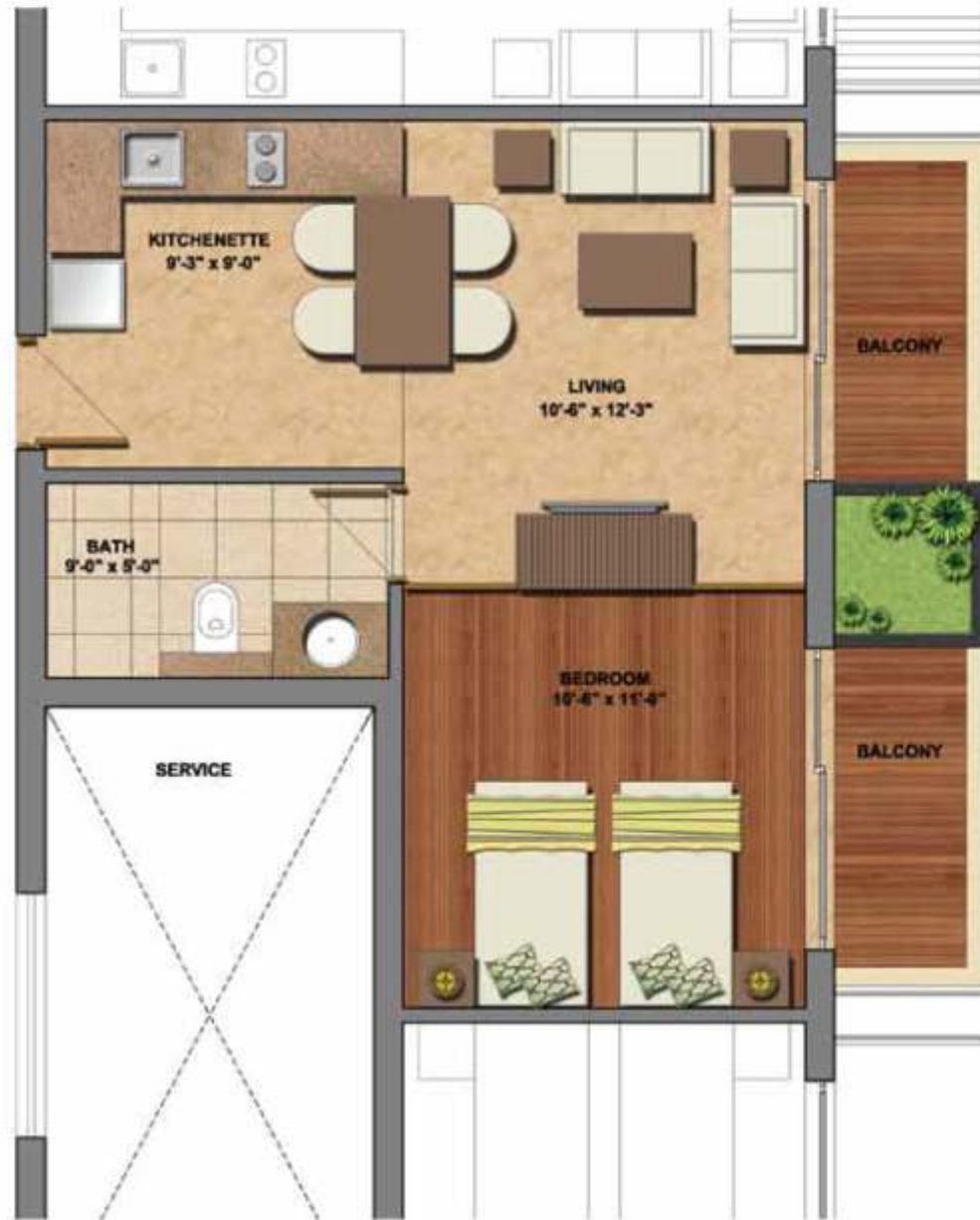
1 BHK Size - 795 Sq. ft.