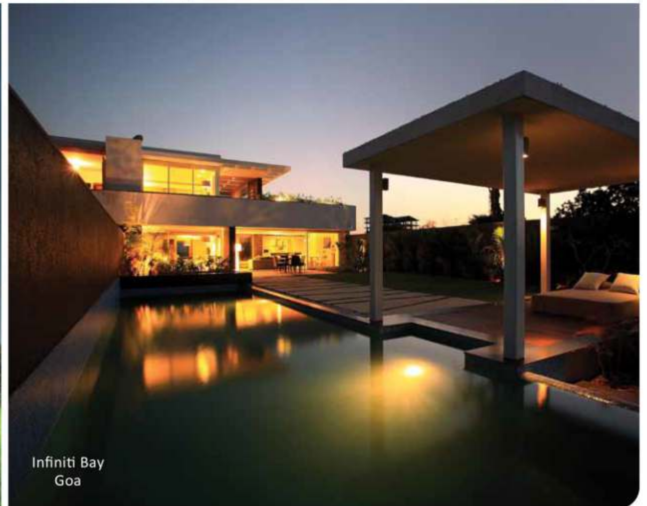
Infiniti Bay Goa