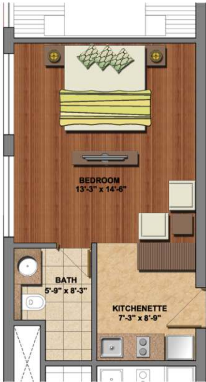
Studio Size - 595 Sq. ft.