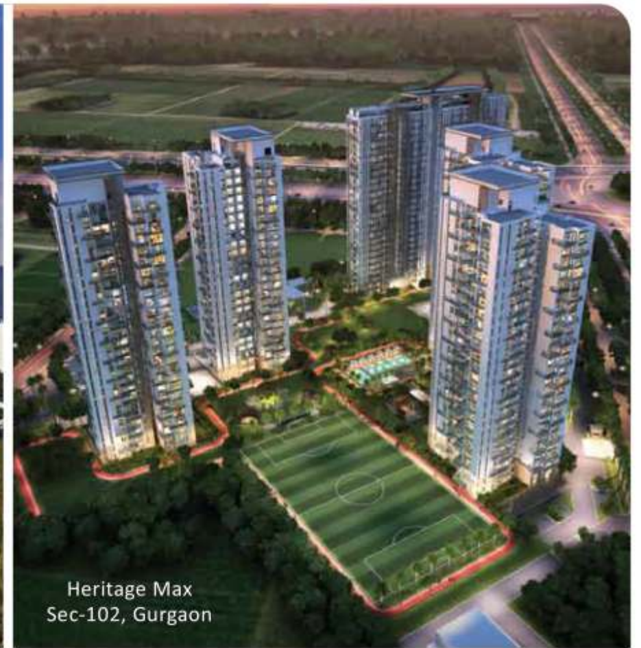
Heritage Max Sec-102, Gurgaon