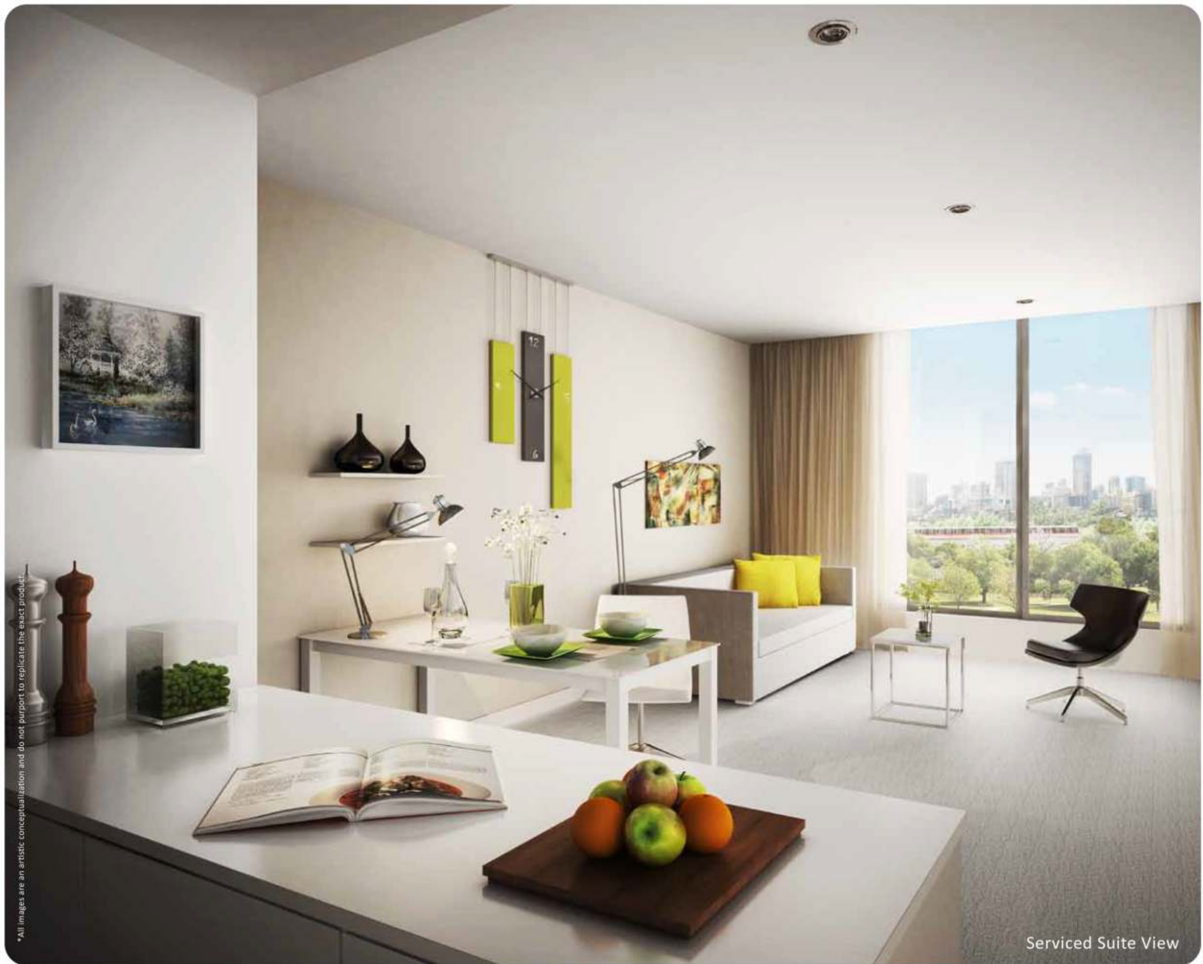
Serviced Suite View

* All images are an artistic conceptualization and do not purport to replicate the exact product.