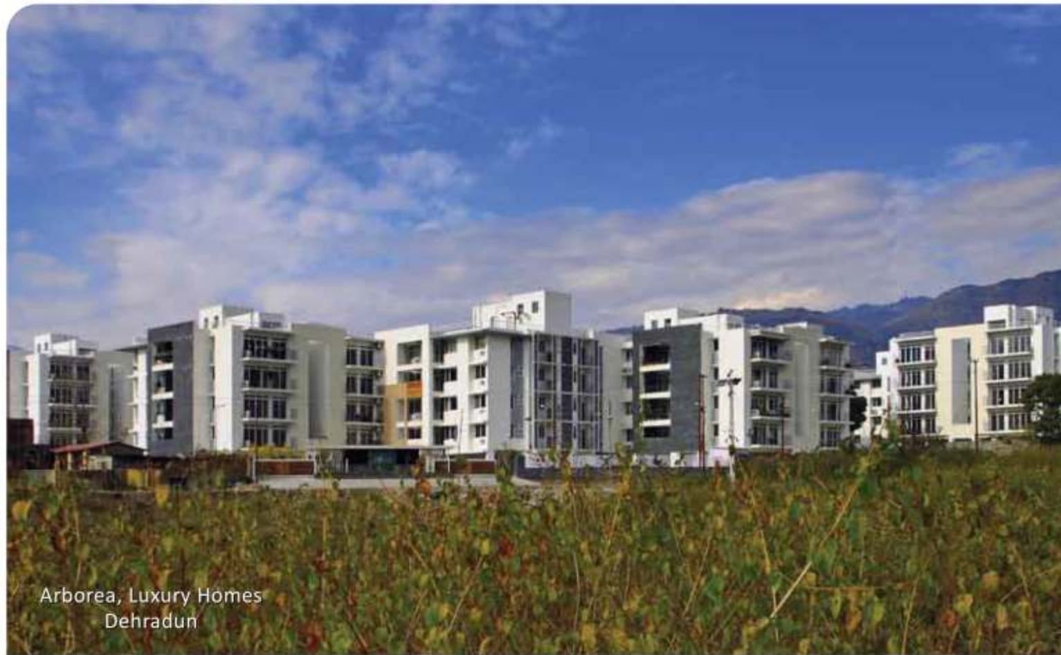
Arborea, Luxury Homes Dehradun