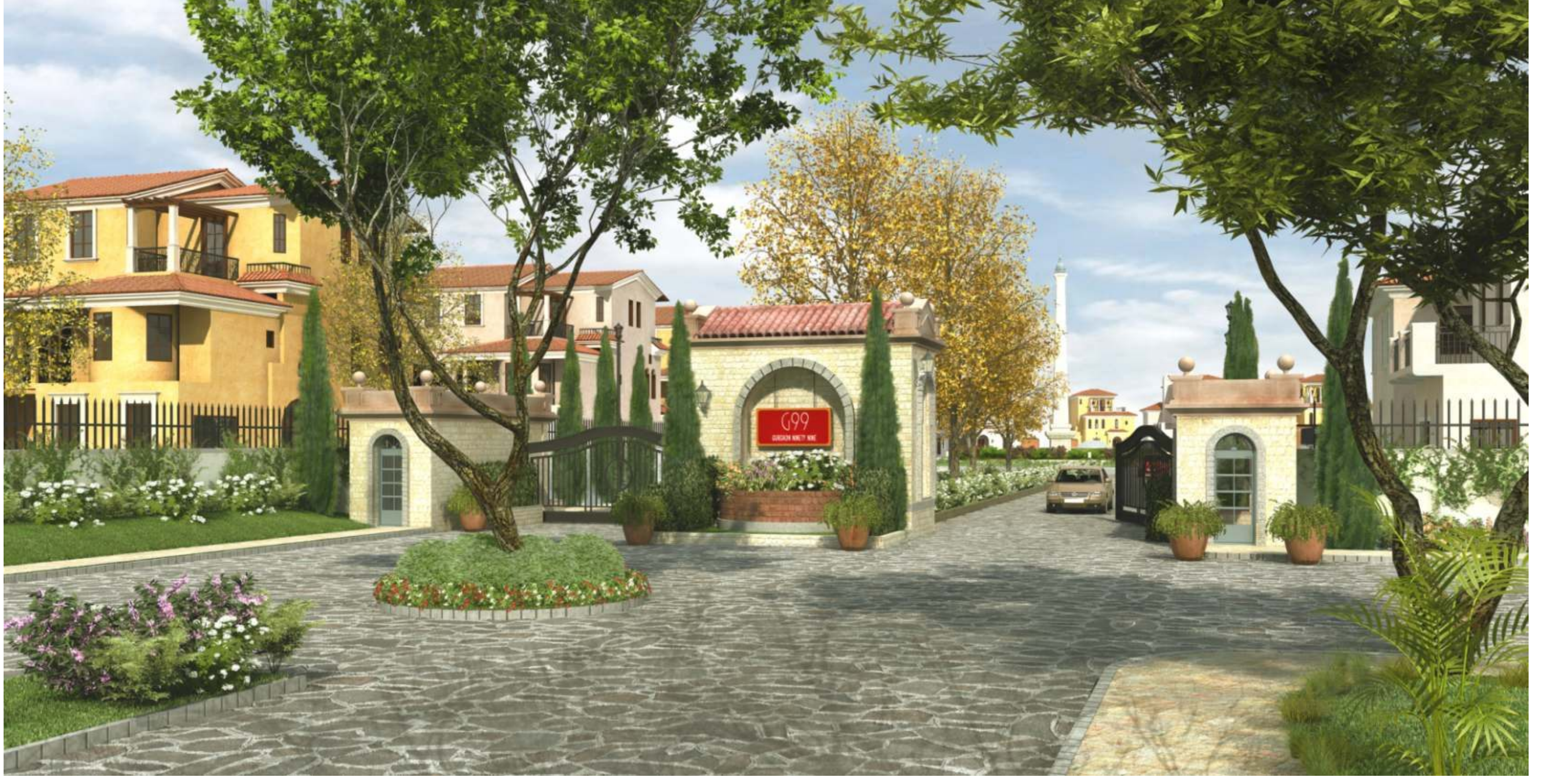
Main Entrance at Gurgaon 99