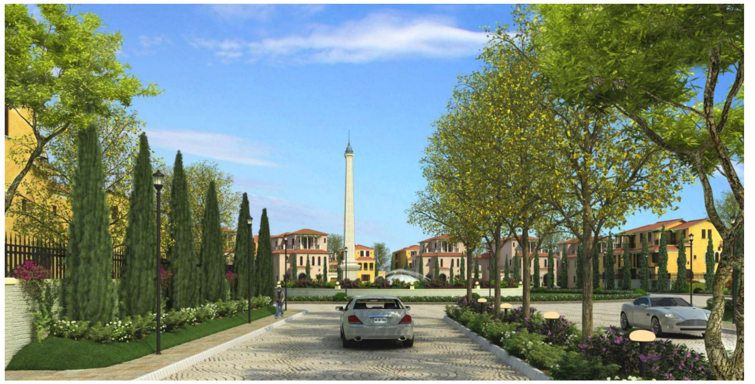
Streetscape at Gurgaon 99