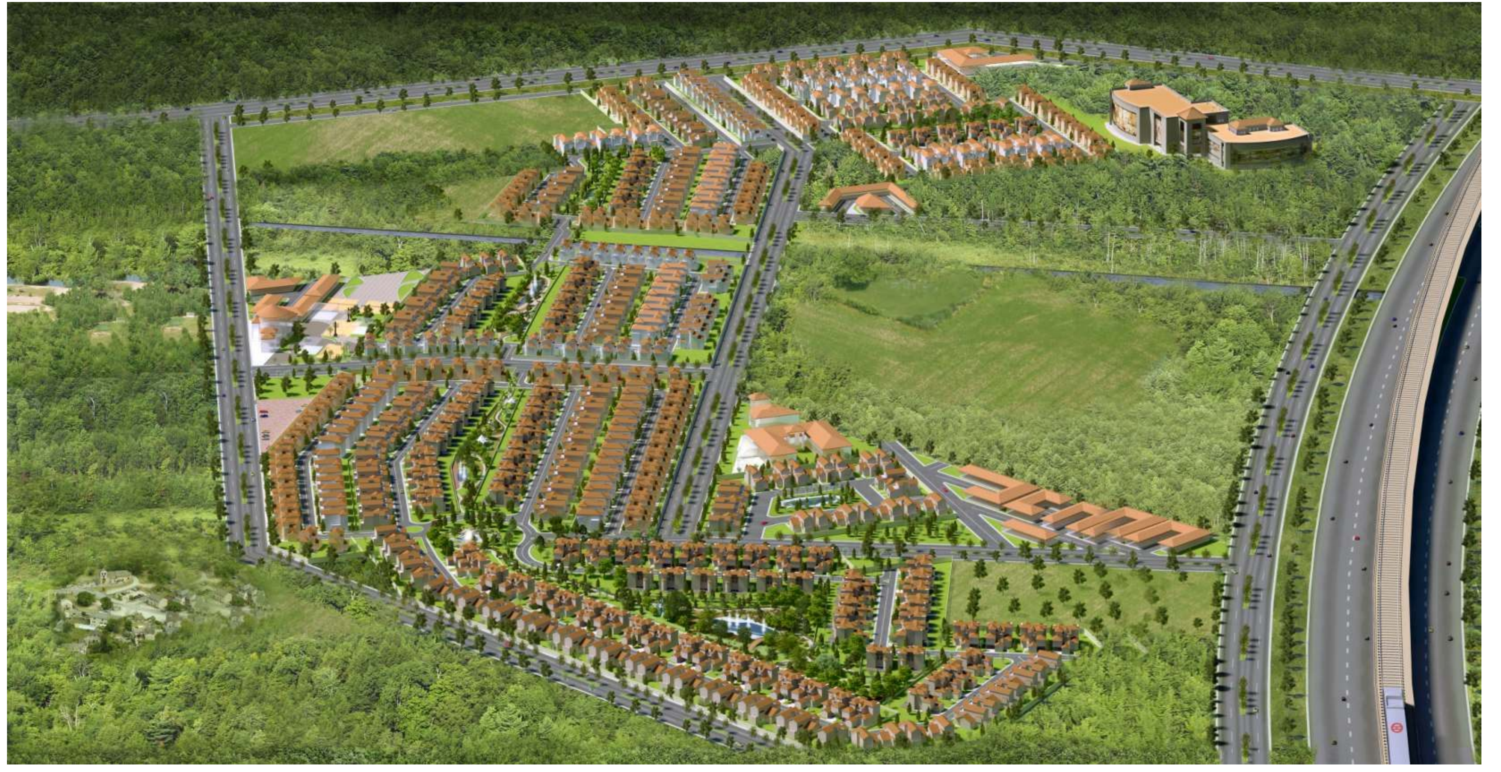
Aerial View of Gurgaon 99