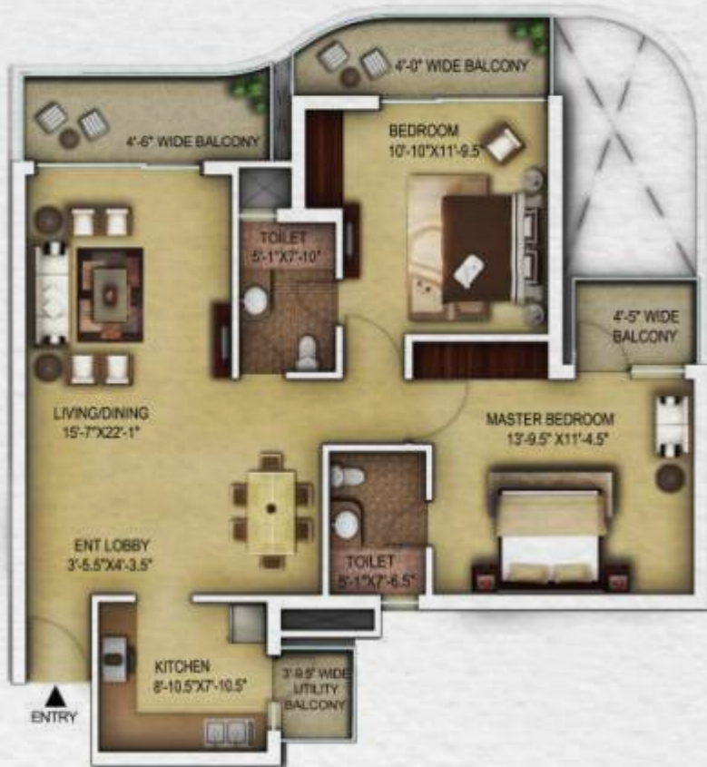
2 BHK TYPICAL UNIT PLAN

TOWER E & F SUPER AREA 1385 SQ.FT CARPET AREA 845 SQ.FT BUA 940 SQ.FT