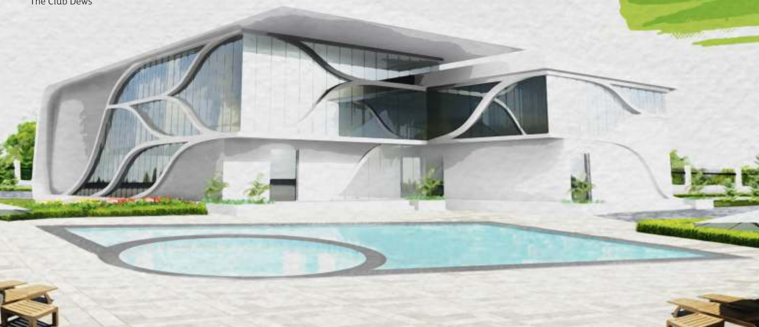
The Club Dews