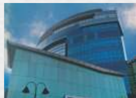
PARAS DOWNTOWN CENTER