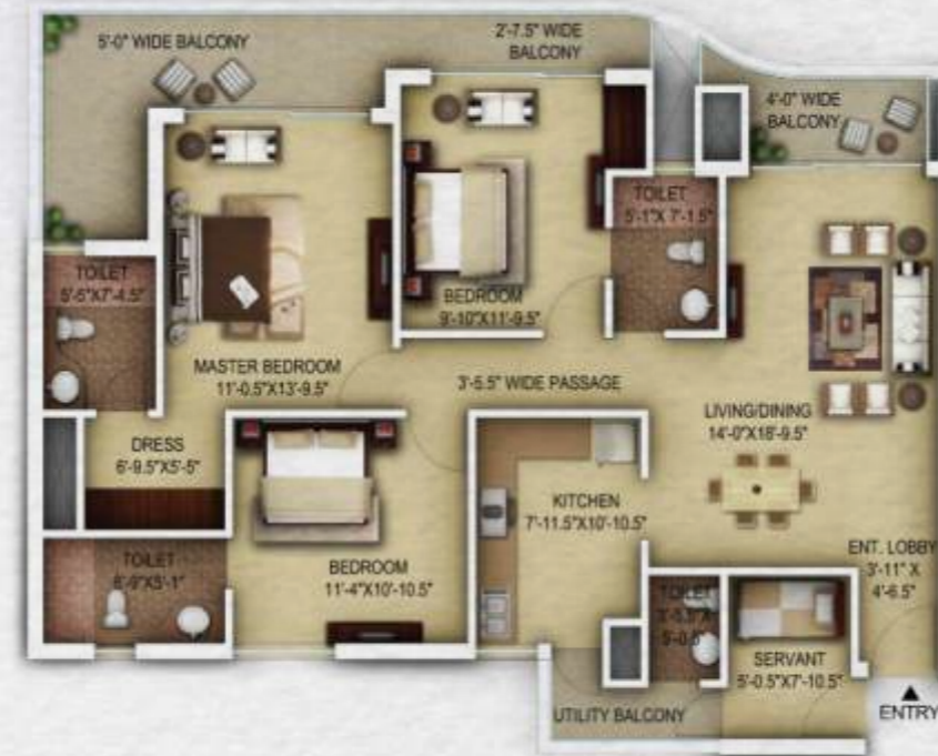
3 BHK + SERVANT TYPICAL UNIT PLAN

TOWER E & F SUPER AREA 1385 SQ.FT CARPET AREA 845 SQ.FT BUA 940 SQ.FT