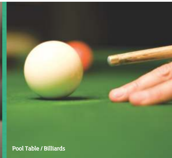
Pool Table / Billiards