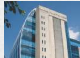
PARAS TWIN TOWERS