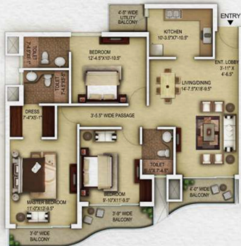
3 BHK + SERVANT TYPICAL UNIT PLAN

TOWER B & C SUPER AREA 1665 SQ.FT CARPET AREA 1034 SQ.FT BUA 1145 SQ.FT