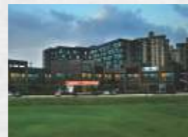
PARAS TRADE CENTRE