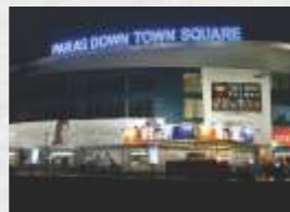
PARAS DOWNTOWN SQUARE