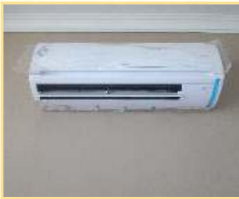
Split Air Conditioner by HITACHI