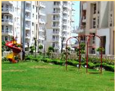
Lush Green Lawns with Kids Play Area