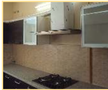
Modular Kitchen with Hob and Chimney by GLEN