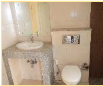
Bath & Sanitary Fittings by KOHLER