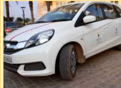
First to Start 24x7 Concierge Services