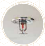
Combustible Gas Leak Sensor