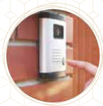
Emergency/ Panic button & Smart Indoor Siren