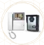
Video Door Bell

*These are a part of the standard offering provided by Joyville Shapoorji to all apartment buyers independent of their decision to subscribe to JioFiber or not. Service charges applicable towards usage of these services will be borne by the customer.