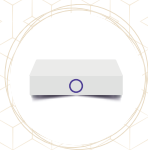
Smart Home Hub