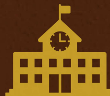
Provision for Pre-school & Nursing Home