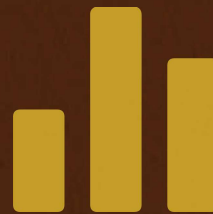
Multiple Plot Sizes Ranging from 210 sq.m to 1007 sq.m

The luxury of owning a piece of land also comes with the luxury of choices. Build a villa with a garden for your grand family, build multiple floors for the future generations, or use it to generate passive income for yourself. With all the modern amenities, this integrated township is completely ready to make your dreams a reality.