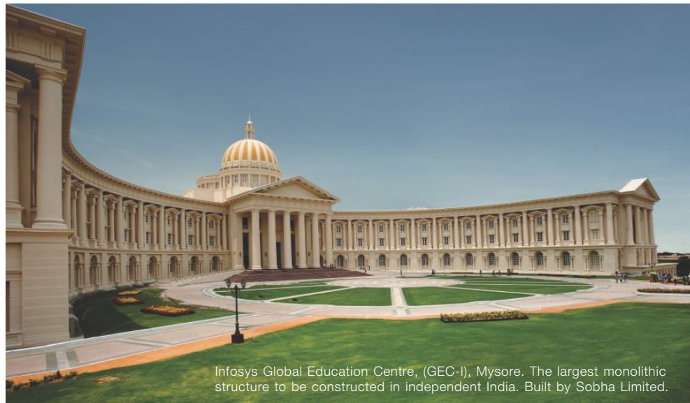
Infosys Global Education Centre, (GEC-I), Mysore. The largest monolithic structure to be constructed in independent India. Built by Sobha Limited.

Such is the craftsmanship and attention to detail of a SOBHA home that it becomes a legacy, an heirloom, a milestone and an exceptional emotional statement. This indisputable standing comes from the consistency with which SOBHA has inculcated its passion for excellence ever since it was founded in 1995. Sobha's in-house expertise, backward integration model and an organization culture of excellence has helped them deliver high quality homes on time, every time.